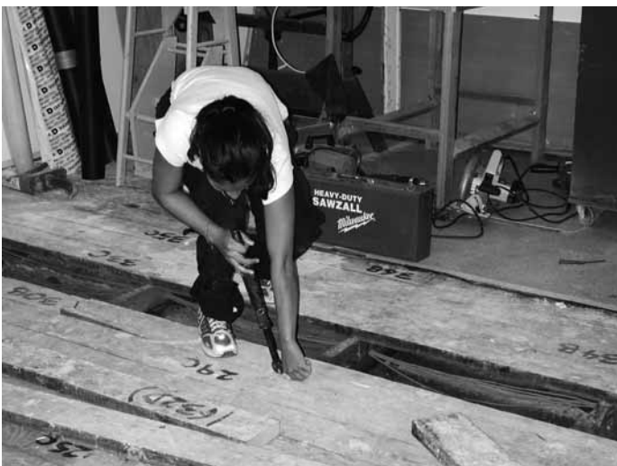
removing subfloor planking in print shop and den