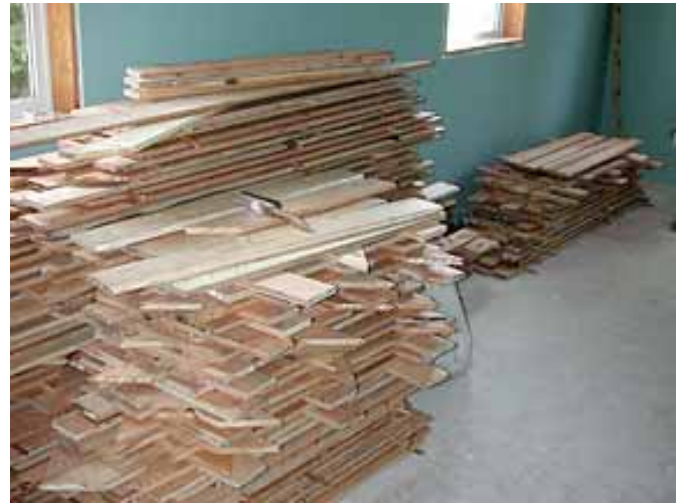
replaned homemade fir flooring