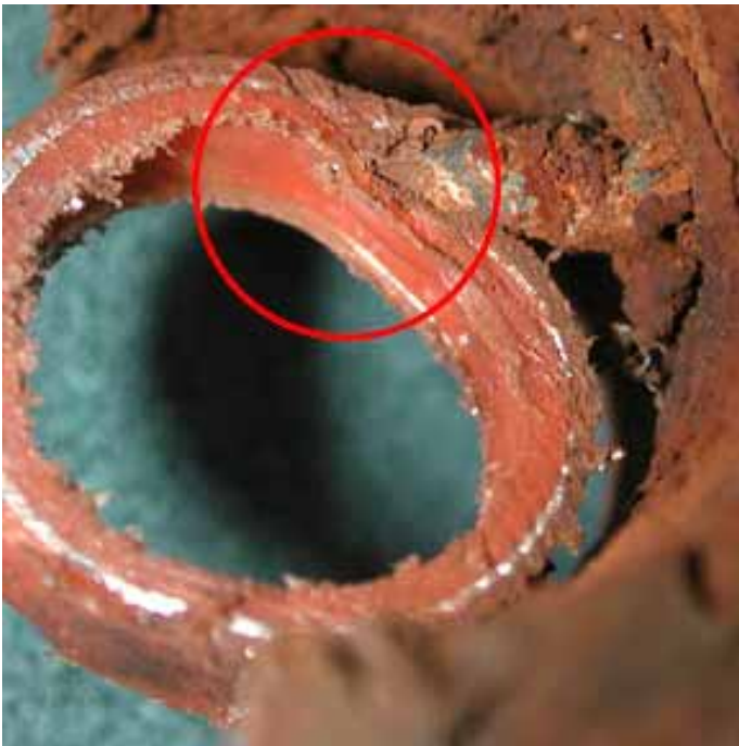
the floor spike that grazed a Kitec heating line by .5 mm, draining the antifreeze from our system and eventually causing it to freeze and rupture.