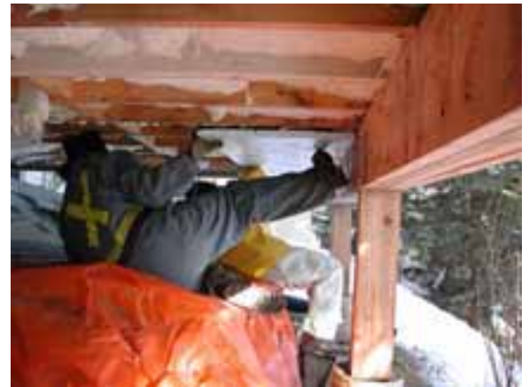
Burt Cohen & Mona Lepine reinsulate underneath bedrooms.