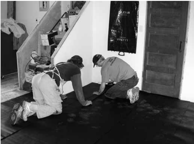
re-laying tarpaper on print shop subfloor