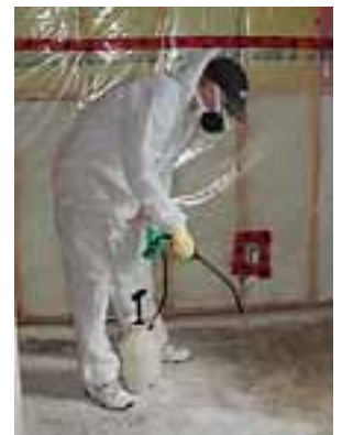
spraying bleach solution to kill mould spores