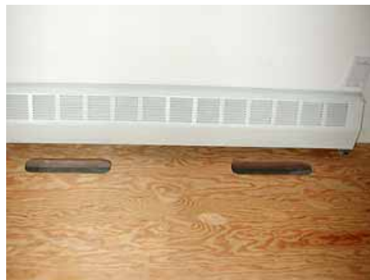
new air vents in shop floor