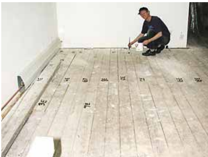
Numbering planks so they'll go back together easily after repairing subfloor underneath.