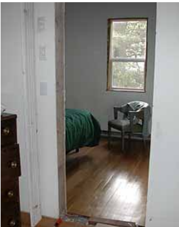
guest bedroom — back!