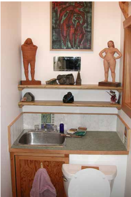
gallery bathroom finished with catalpa wood from Naramata Centre