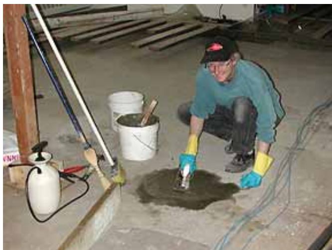
patching damaged concrete in print shop