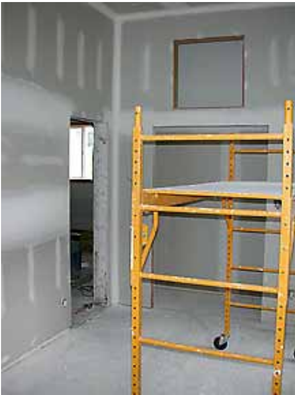
gyproc replaced in bedroom