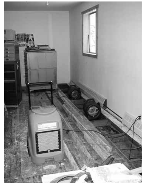
print shop subfloor opened, with blowers & dehumidifiers