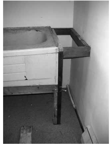
silkscreen washout tub