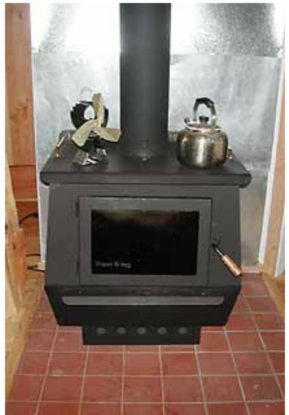
new catalytic Blaze King wood stove