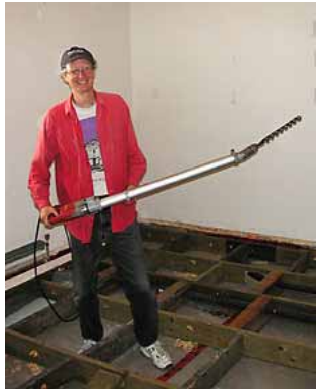
drilling subfloor joists for ventilation