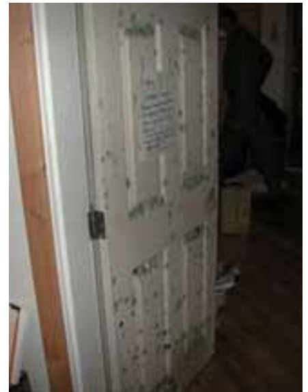
mould on door