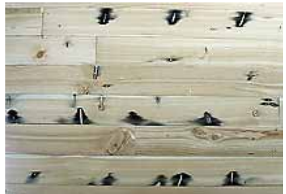
Bill's favourite salvaged flooring with nail stains :-o