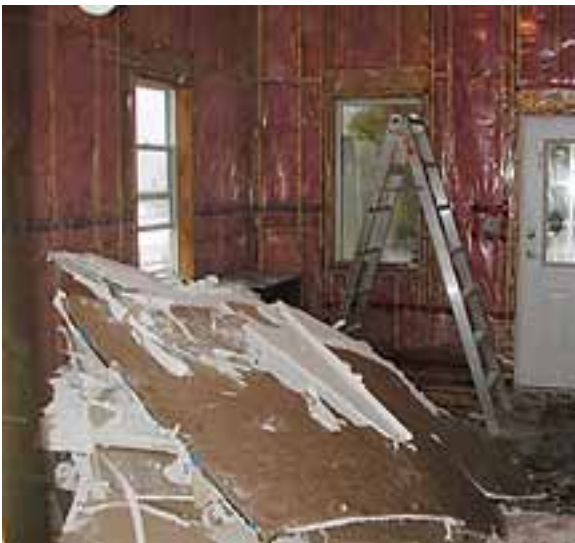
Drywall gutted from bedroom.