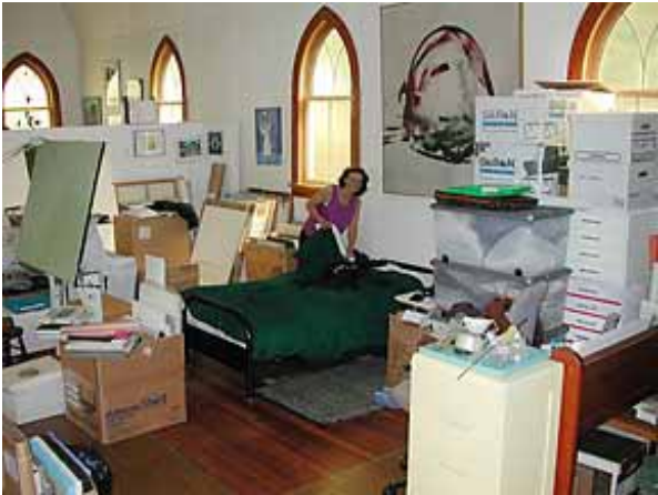
temporary bedroom in the gallery