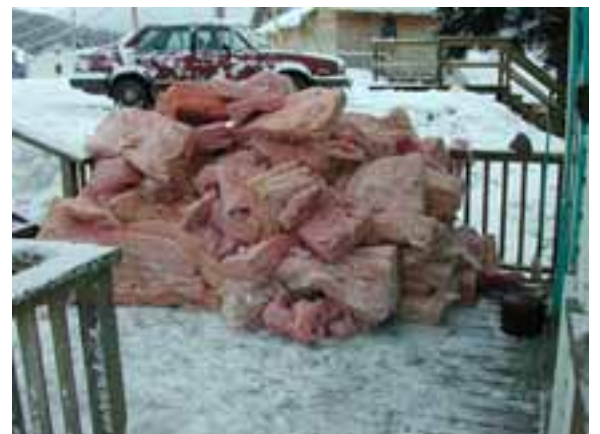
wet insulation removed