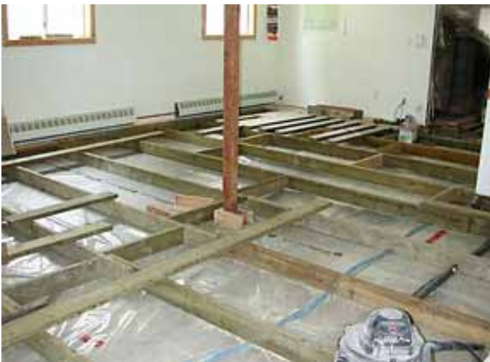
repaired, insulated print shop subfloor