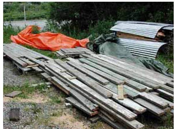
planks airing out