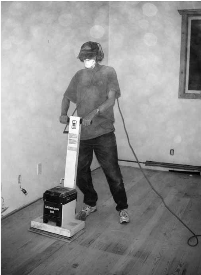
laying, sanding & filling fir flooring