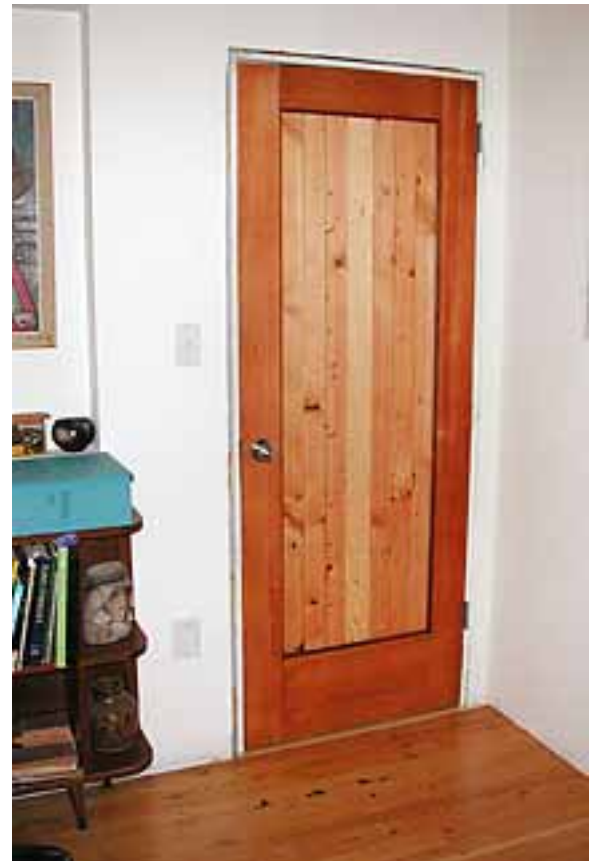
...fir door rebuilt with homemade flooring and installed