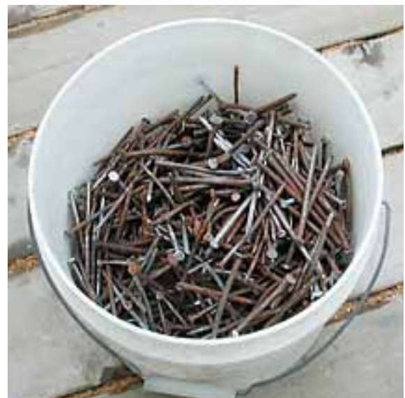
bucket of nails from deplanking party