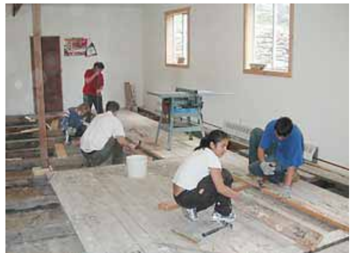
Katimavik crew pulling up planking;