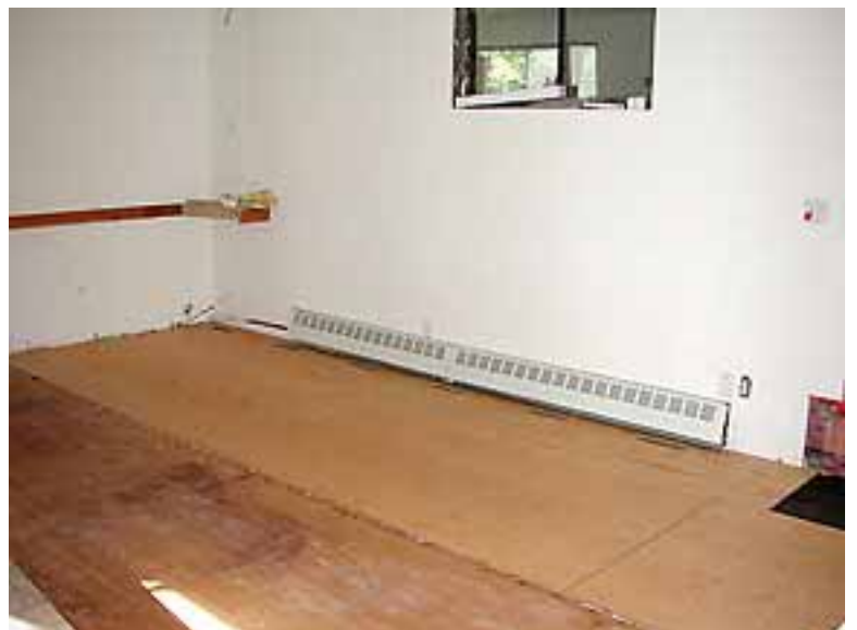
print shop with salvaged & new plywood