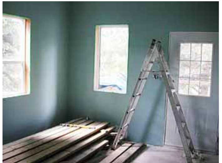
main bedroom repainted;